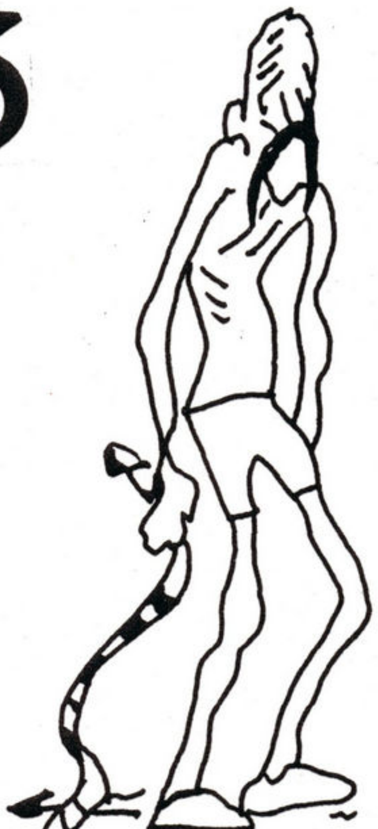
20% = NO KIER DRECHA